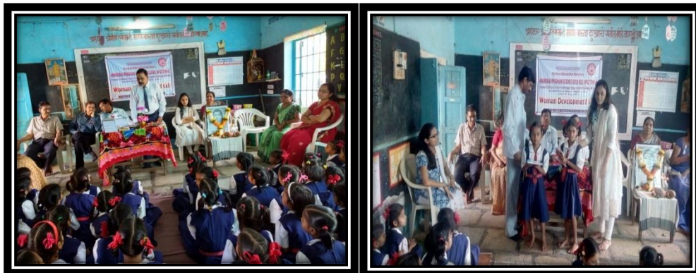
Women's day Celebration at Z.P Kanyashala