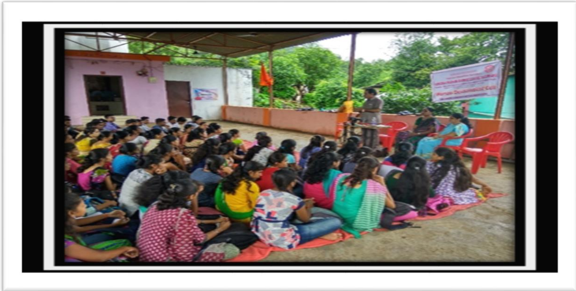
Pictures of Stitching cloth bags & paper bags workshop for women's in nearby village