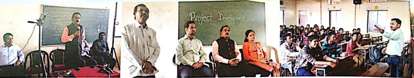
Career Guidance and Placement Cell seminars for final year students