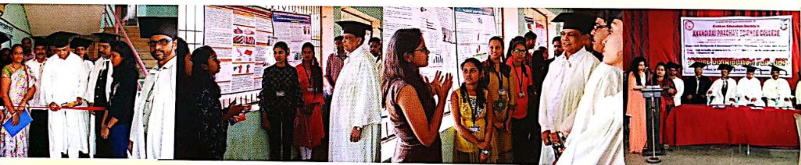
Avishkar Research Convection Poster Exhibitions