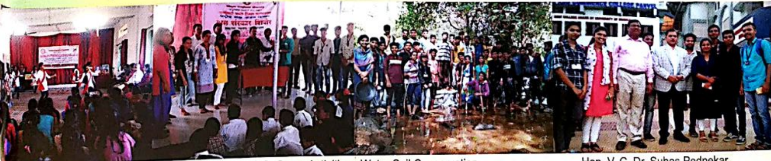
Social Activities :Gathering