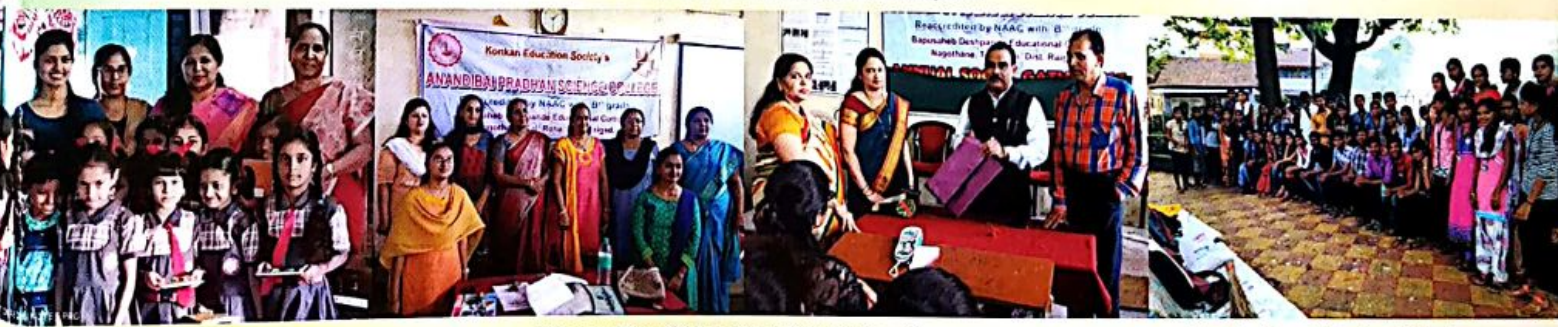
Donation of Note books to Z.P. Girls School at Nagothane