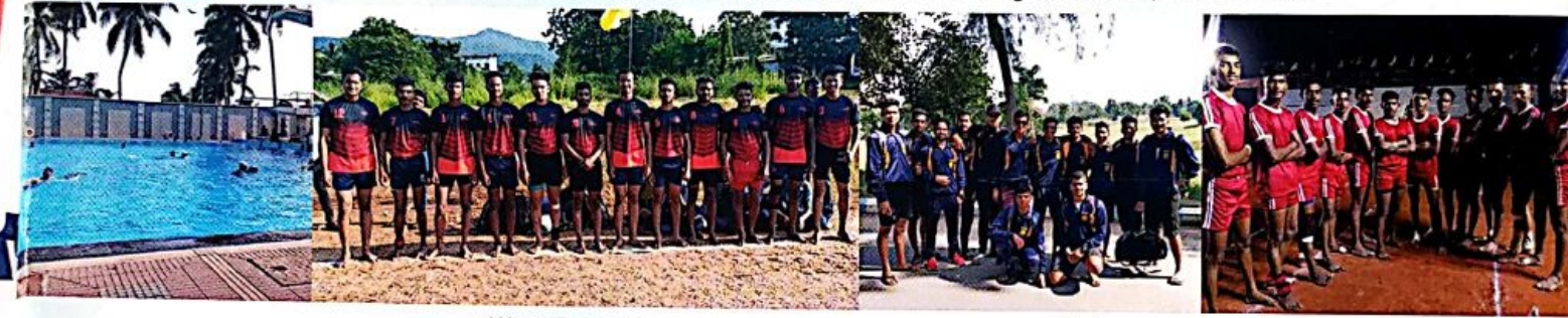
Water Polo Team