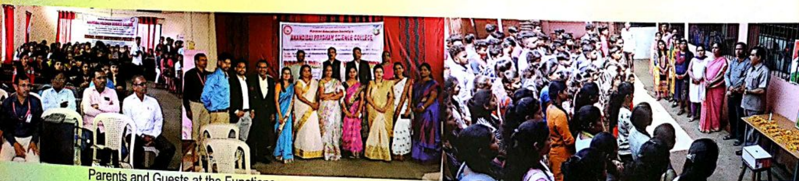
Parents and Guests at the Functions